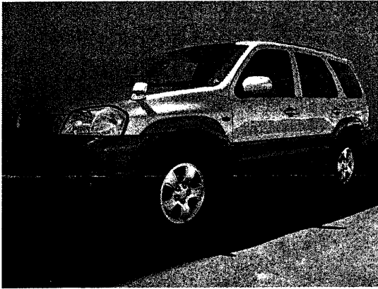
#11697 Mazda Tribute $12,990