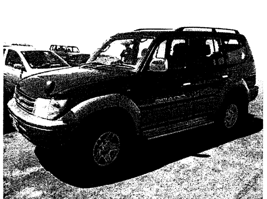
#8998 Toyota Prado $17,990

Phone 0800 333 803 or 027 482 1128 Opening New Workshop Soon!