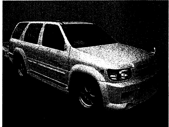
#9724 Nissan Terrano $11,990