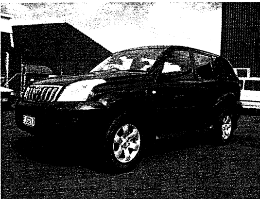
#10773 Toyota Prado $29,990